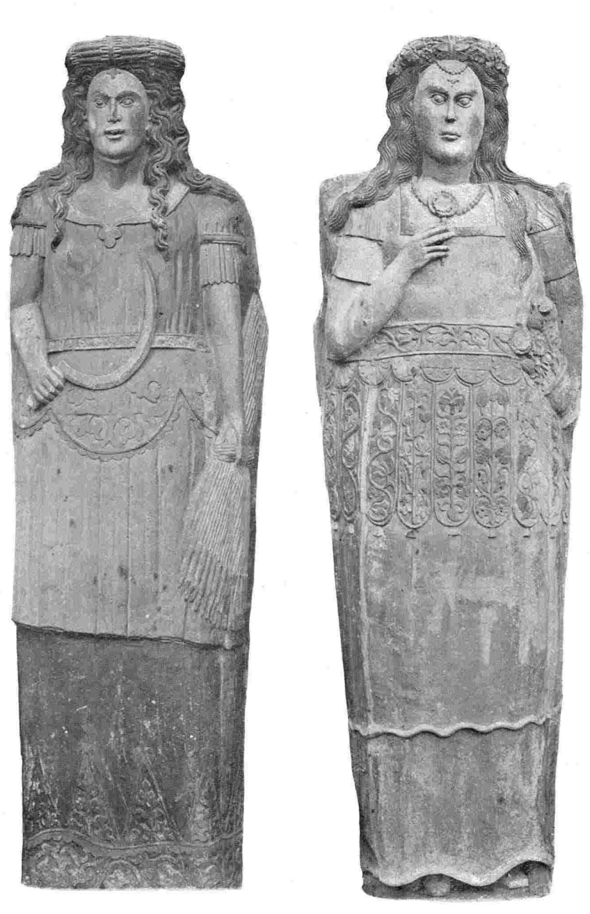
WOODEN FIGURES AT HOXNE PRIORY FARM.